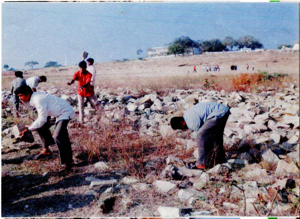
Students Participations in NSS Annual Camp